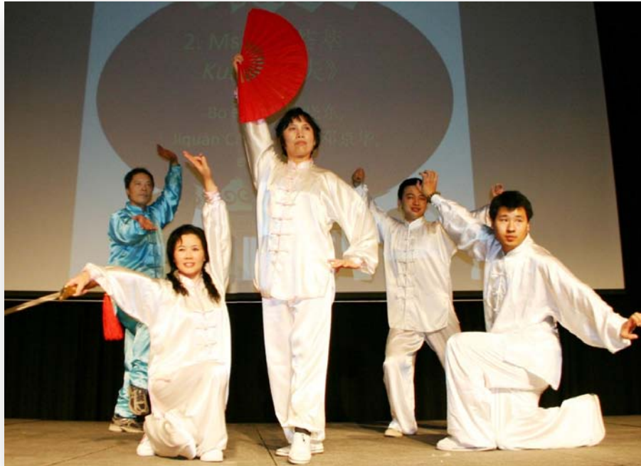
CAGT participates in UT Asian Pacific Heritage Month 3/13 – 7/31/2009