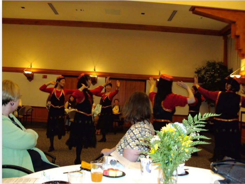
CAGT Organizes Taiji Class