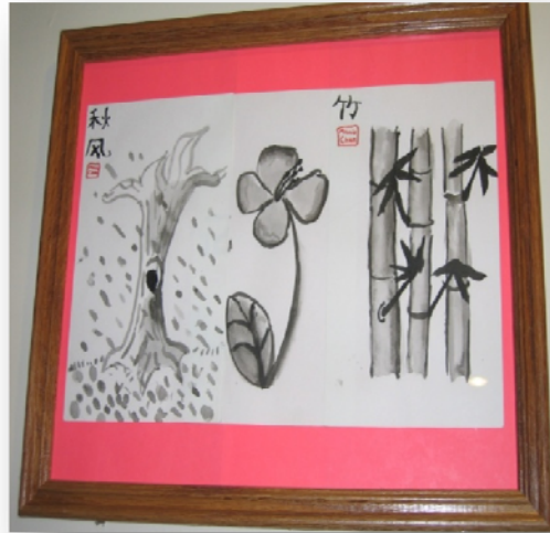
My Sight of Seasons, Chinese Brush Painting