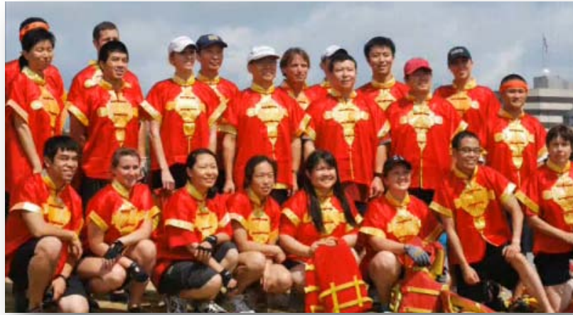
CAGT's Fall Picnic 10/30/2009