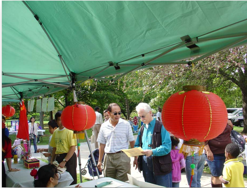
CAGT's Fall Musical Festival 11/15/2009