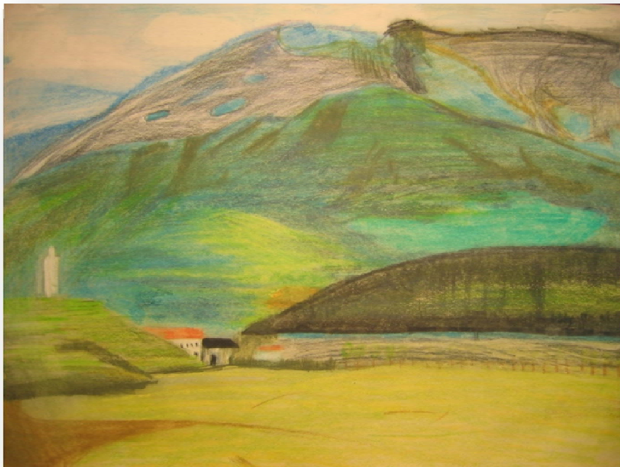
My Home Town, Colored Pencils