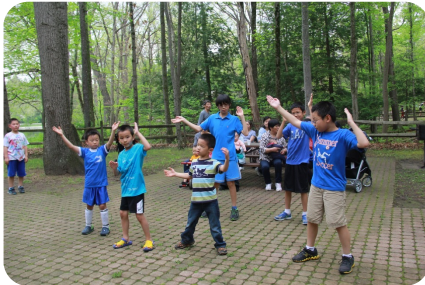
Kids surprised us with some happy dances.